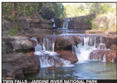
TWIN FALLS - JARDINE RIVER NATIONAL PARK