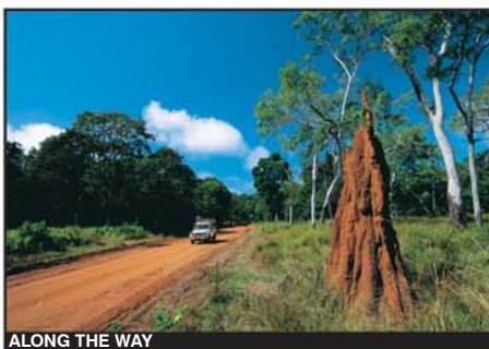
ALONG THE WAY