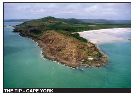
THE TIP - CAPE YORK