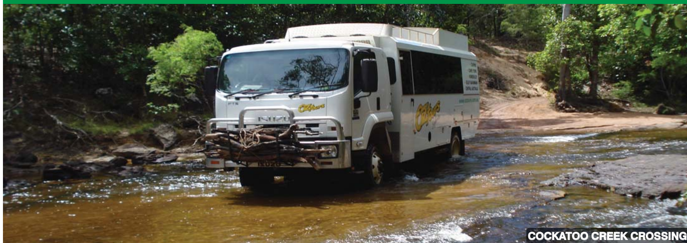
COCKATOO CREEK CROSSING