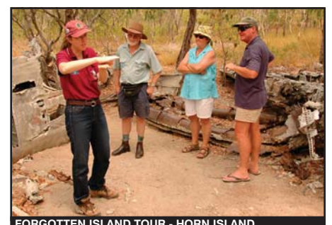
FORGOTTEN ISLAND TOUR - HORN ISLAND