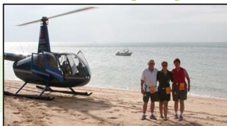
Helicopter Tours From $100.00