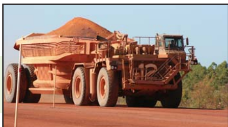
Weipa Town & Mine Tour. 1.5 hours. $35 per person.

Prices are in AUD$, include GST, are accurate at time of printing and are paid direct to the service provider.