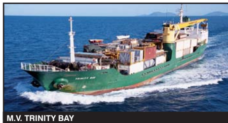
M.V. TRINITY BAY