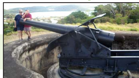
Thursday Island Bus Tour & Museum $35 2 Isle Tour (Thursday & Horn Is.) approx $120 incl. lunch