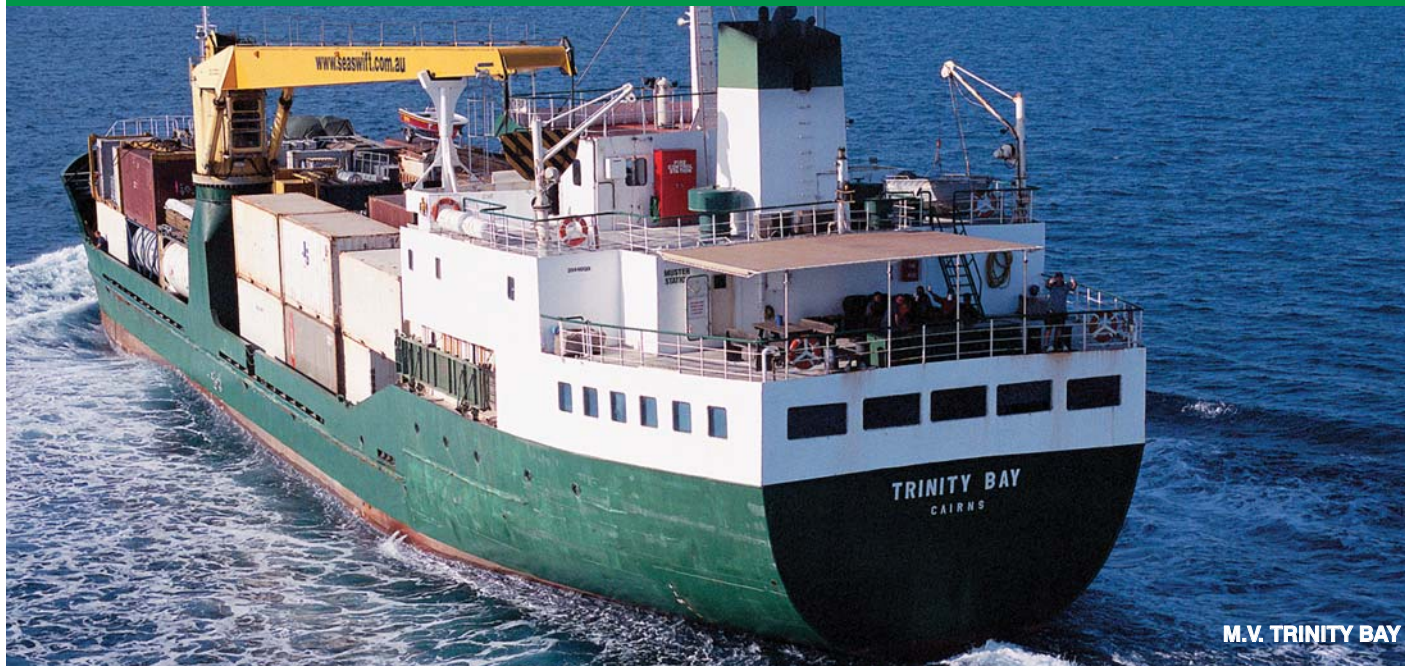
M.V. TRINITY BAY